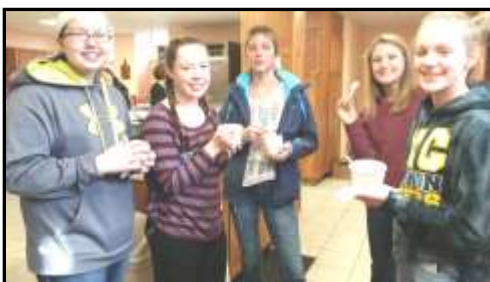
Youth enjoying their chili.