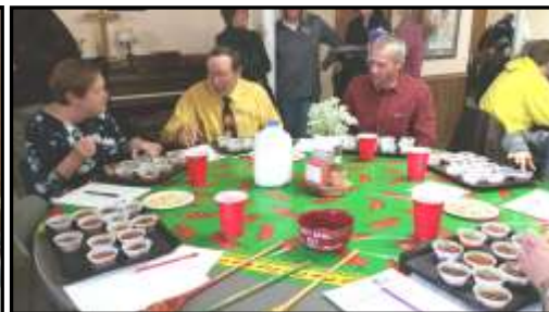
Judges hard at work.