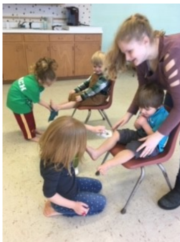
Washing feet like Jesus did.