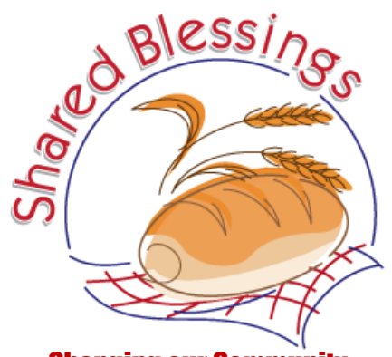
Changing our Community with Compassion

More info will be sent out in August as to specific items that are needed at the shelter. Prayerfully consider helping out in any way possible.